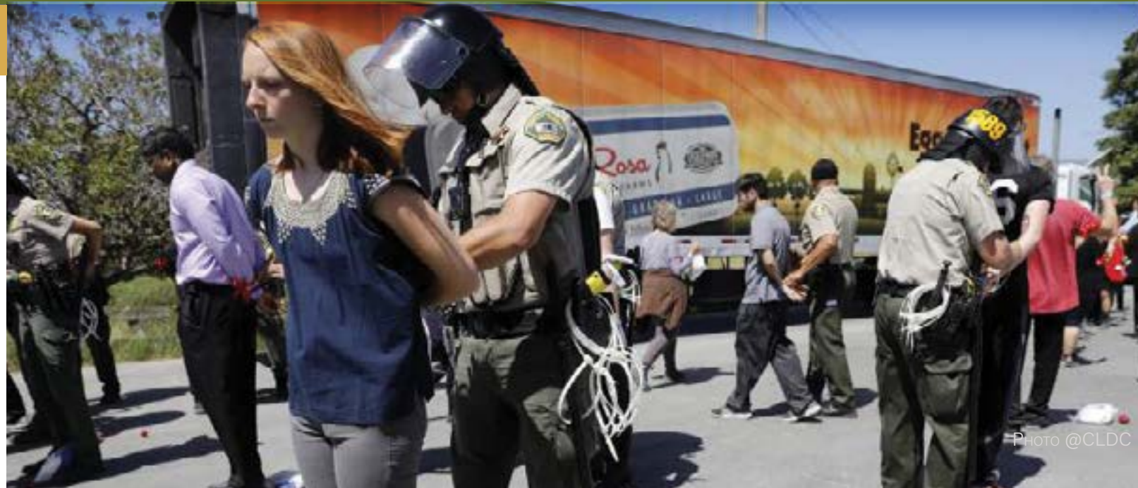
Pictured, above: Forty non-violent animal rights activists face arrest at the Sunrise Egg Farm in Sonoma County, California. Pictured, below: Extinction Rebellion street demonstration demanding action on climate change. CLDC provides pro bono legal defense to these and other groups.

In 2019 CLDC continued our legacy work in defending animal rights activists for their nonviolent actions confronting horrific abuses that expose disgusting health and safety